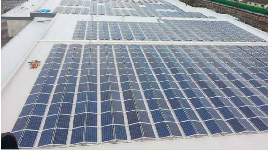
Hemsbach | Germany Installation: 350 kW | D-Dome System