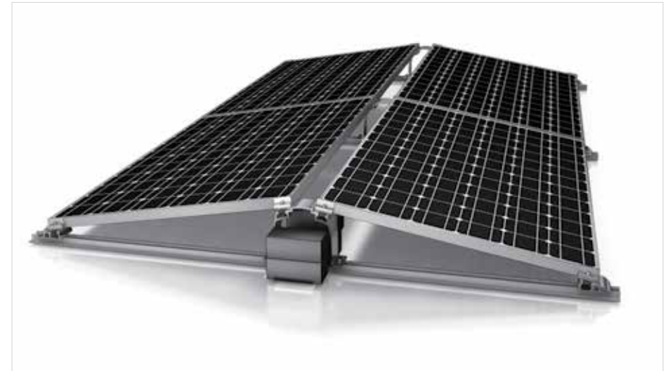
Detail illustration - D-Dome System