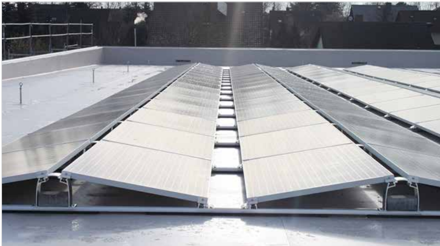
Hemsbach | Germany Installation: 350 kW | D-Dome System